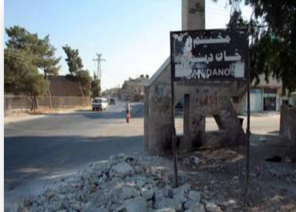
Khan Dannon camp

army making the camp vulnerable to shelling and the fall of a number of shells into different parts of it leading to many victims and wounded.