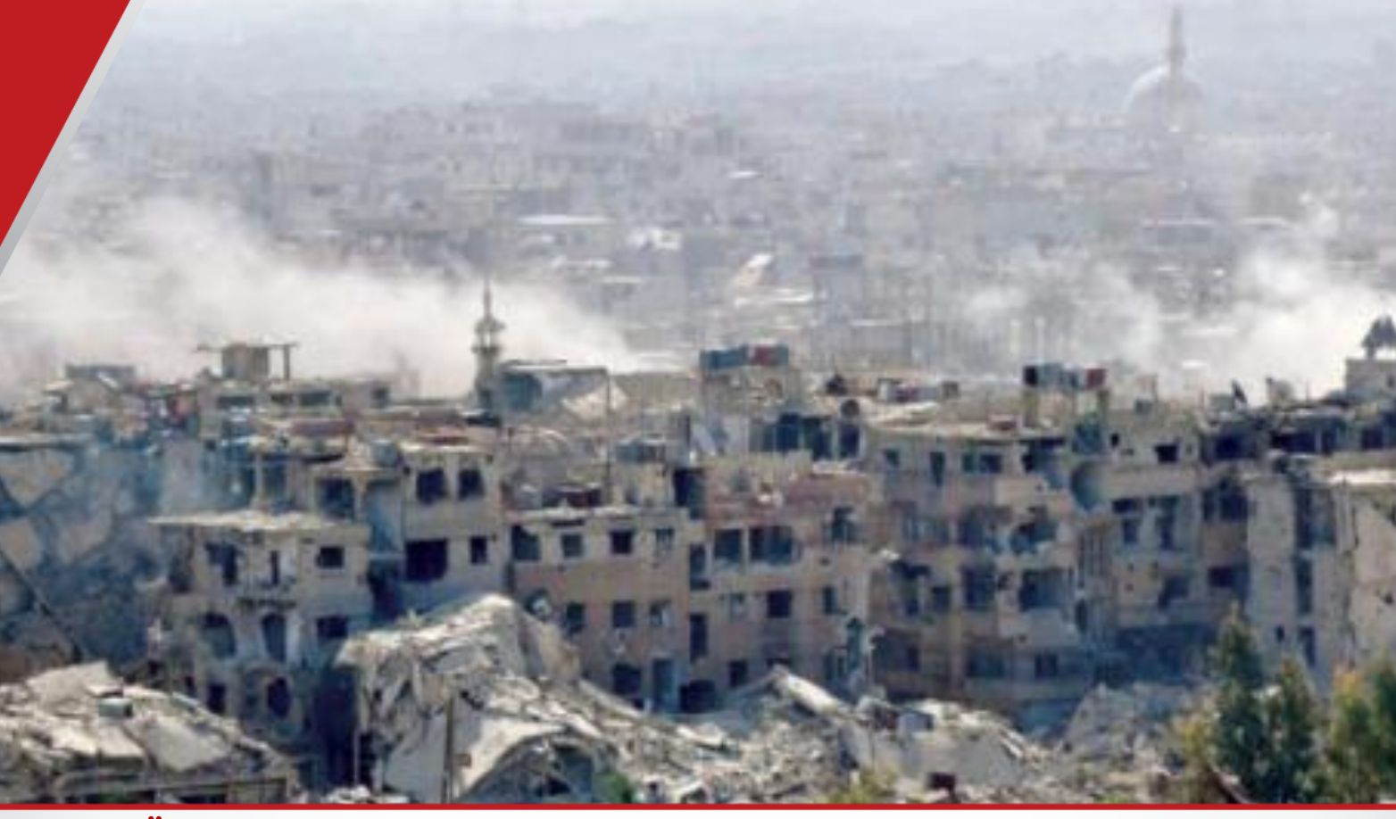
"United Nations: The Syrian regime is preventing the entrance of assistance to Yarmouk camp"

Daily report on the situation of Palestinian refugees in Syria