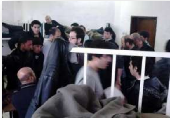
Palestinian detainees in Ghazi Baba prison

The AGPS connected with a number of international human rights organizations, and provided it with as reports in English language about the conditions of detainees in Macedonia, which met interest of those human rights organizations, who promised to act to alleviate the suffering of refugees in Macedonia.