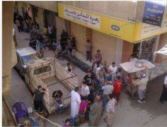
Al Aedein camp in Hama