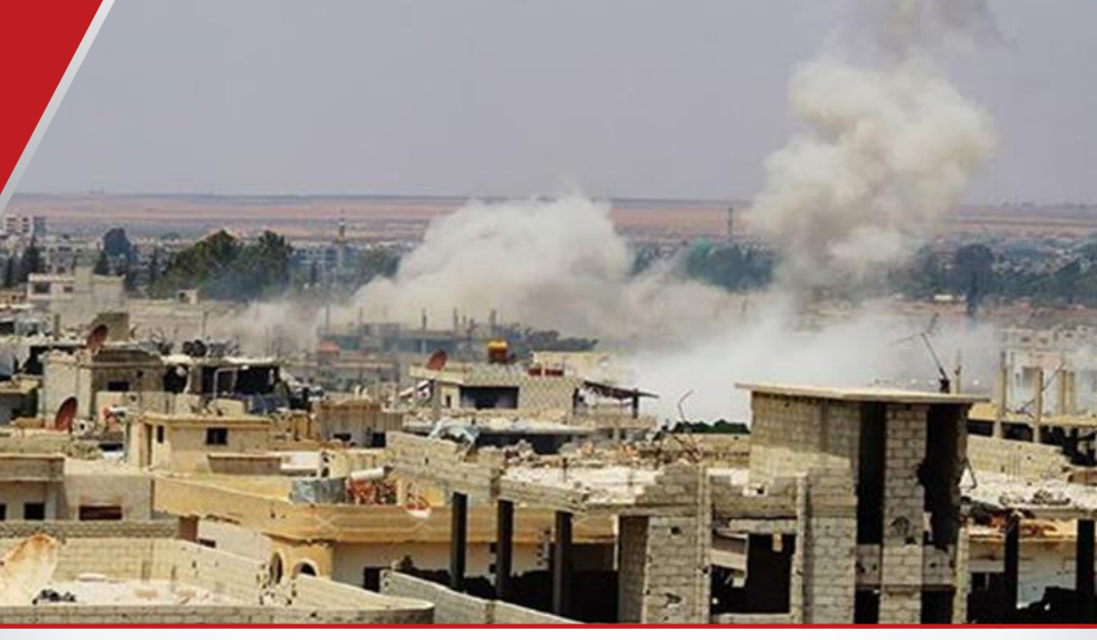
"Palestinians of Syria Relief Commission Appeals for Urgent Humanitarian Assistance South of Syria"

Daily report on the situation of Palestinian refugees in Syria