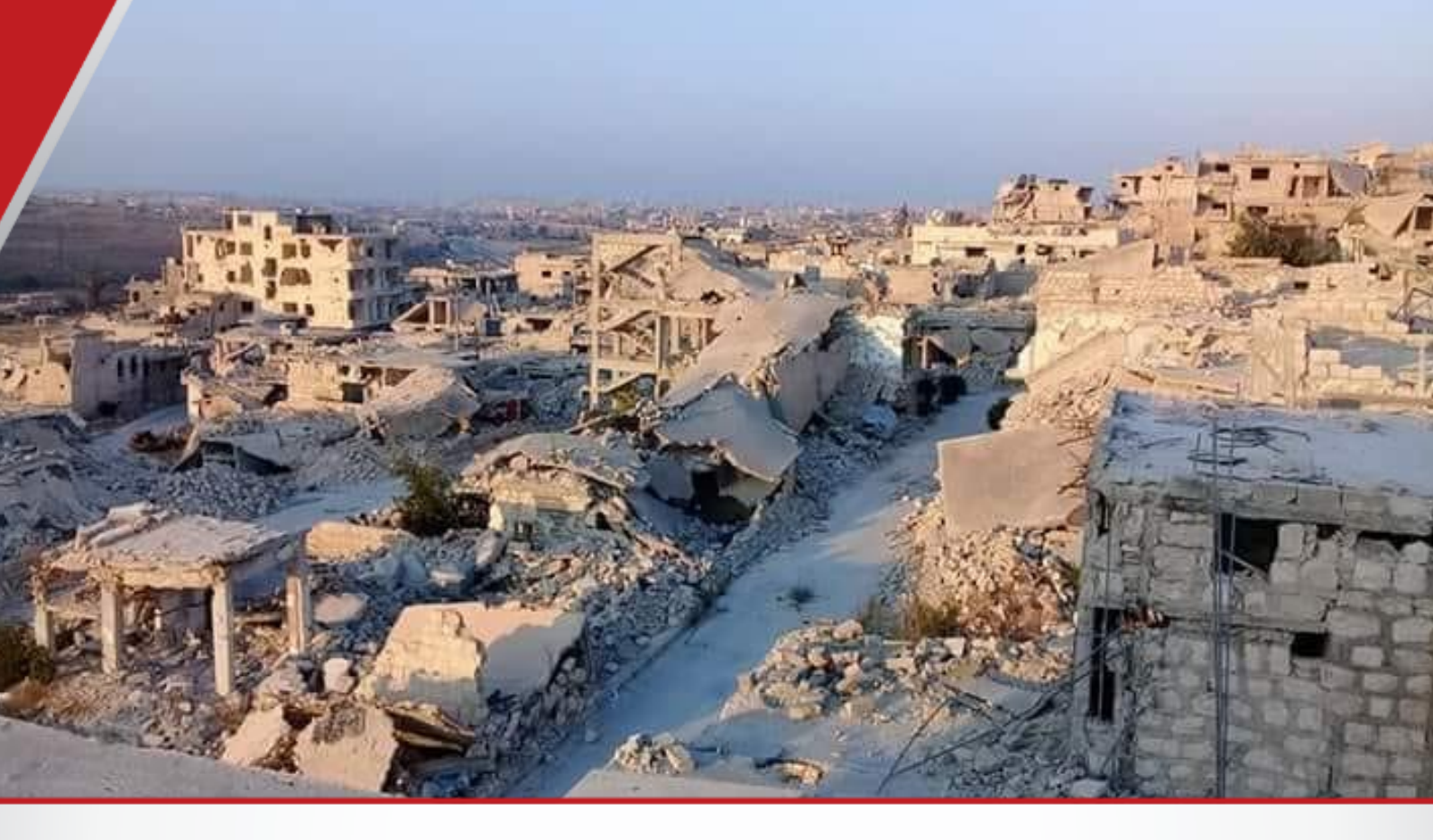
"Residents of Handarat Camp Call for Urgent Action by UNRWA"

Daily report on the situation of Palestinian refugees in Syria