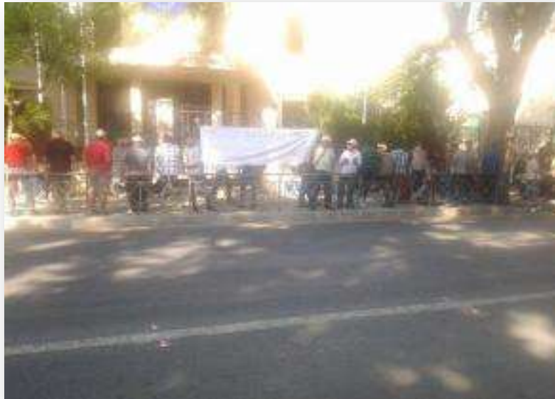
The open sit- it front of the UN Office

An open sit- it performed by a number of Palestinian Syrian and Syrian refugees who were rescued by the Greece Cyprus Coastal guards on 26-9-2014, who were put in a Camp specified for the refugees in the Cyprus Capital of Nicosia. The refugees perform the sit-in in front of the UN Office and the High Commissioner for Palestinian Refugees asking to help them through their distress and to reach European countries to reunion with their families.