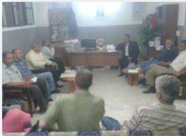
The visit to Democratic Front Office in Lebanon

Within its Purposeful steps to confront the decision of the UNRWA about the cash assistance cut of 1,100 Palestinian Syrian families displaced in Lebanon, the Follow-up Committee for Displaced Palestinians from Syria to Lebanon visited the Democratic Front Office, as part of a series of meetings and contacts with the Palestinian factions and powers to coordinate to face that decision and to press on UNRWA in order to undo it.