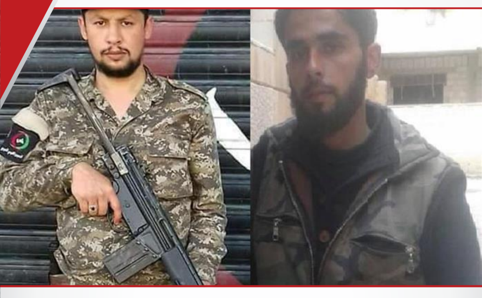
"Two Palestinian refugee die in the ongoing war in Syria"

Daily report on the situation of Palestinian refugees in Syria