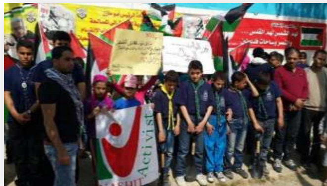
The solidarity vigilat in Ein Al-Hilweh camp

They demanded saving the Yarmouk camp, neutralizing it from the ongoing conflict in Syria, expelling ISIS out of the camp, and returning the residents. It is worth mentioning that the number of Palestinians of Syria who fled to Lebanon after the war in Syria, has exceeded "51" thousand refugees, according to previous statistics by UNRWA.