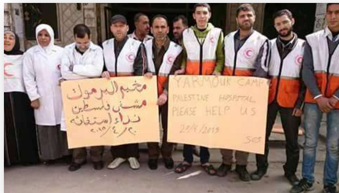
The PRCS Volunteers sit-in in Yamouk camp

It is noteworthy that most of the relief organizations within the Yarmouk refugee camp stopped working for fear of its volunteers to be targeted by ISIS.