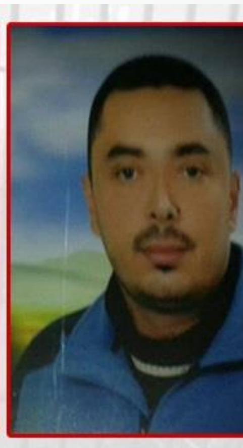
"3 Palestinians Tortured to Death in Syrian Gov't Jails"