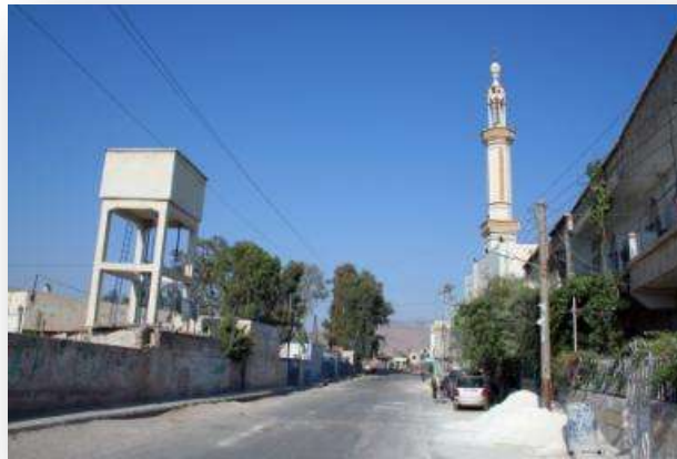
Khan Dannon camp

Meanwhile, sporadic clashes broke out at Khan Dannon camp in the adjacent town of Tiba, between the Syrian armed opposition groups and the Syrian regular army.