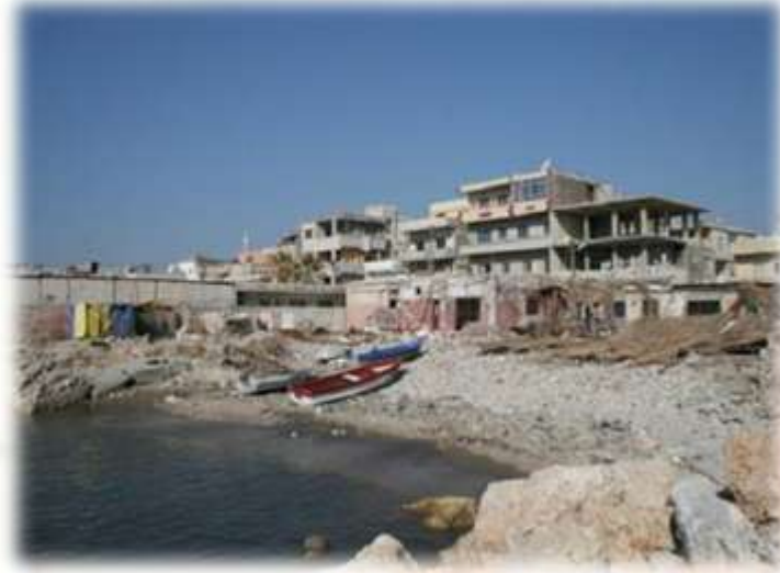
Al Raml Camp